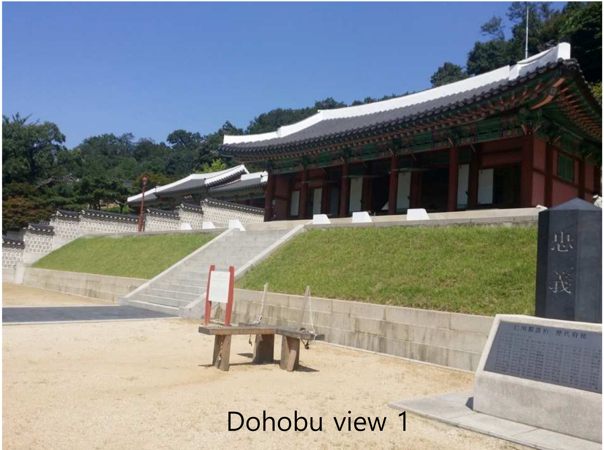
Dohobu view 1