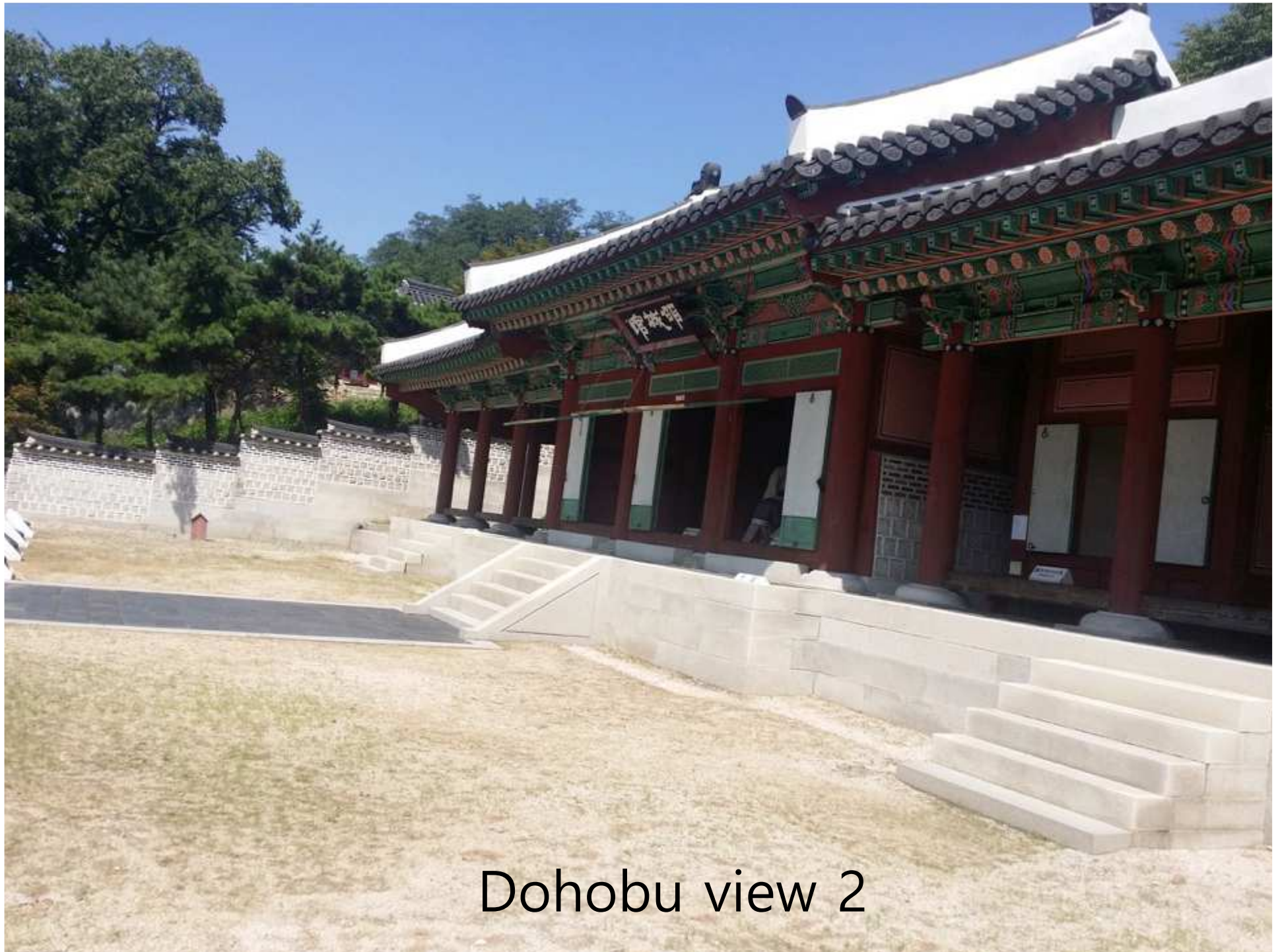
Dohobu view 2