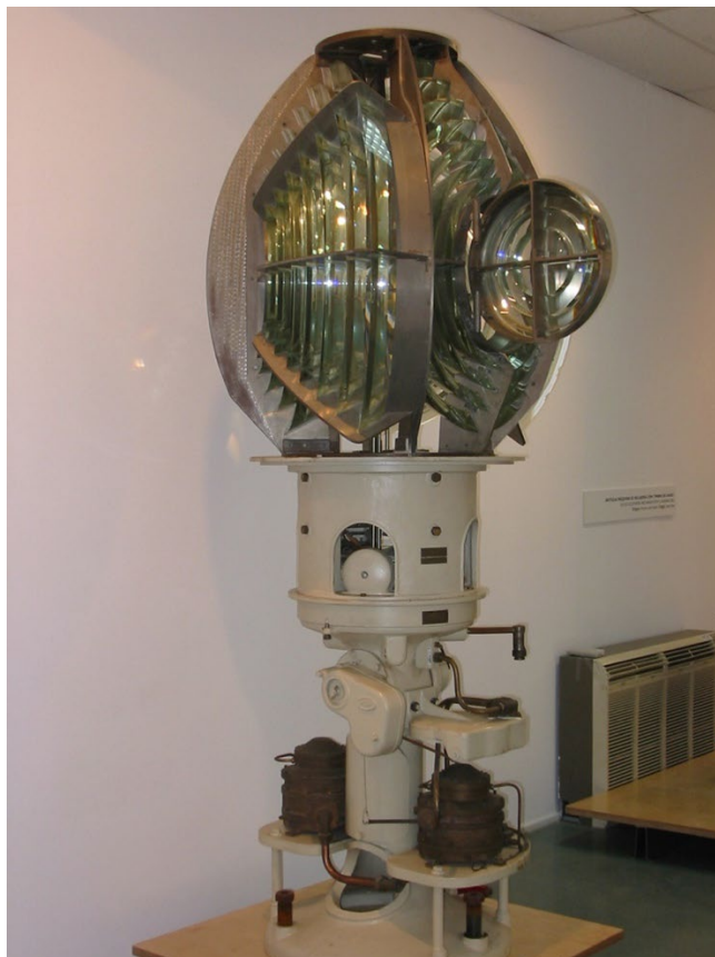
Figure 12 Dalen system acetylene gas apparatus with revolving optic.

Figure 12 - Dioptric catadioptric optic with 300 mm focal distance lenses and a characteristic group of 2+1 flashes. Tras-130 gas mixers. Manufactured by AGA (Sweden)