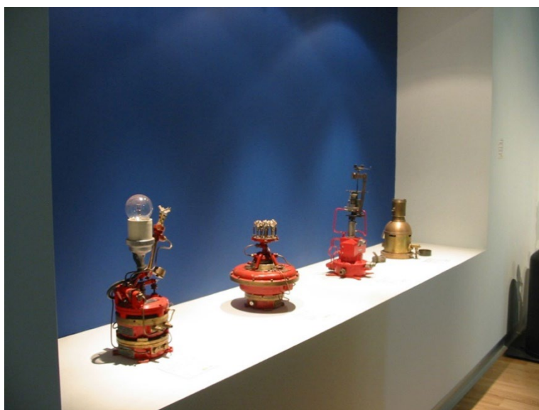
Figure 13 Various historical lamps

Figure 13 - From left to right: 1. - Electric lamp with a Goliat bayonet-type lamp holder with a flashing changer model AGA and lamp acetylene gas reserve. 2. - Flashing bare acetylene gas flame lamp with multiple burners. 3. - Incandescent acetylene gas mantle burner with automatic changer. 4. - Chance 85 mm lamp for a petroleum gas pressure incandescent mantle light installation.