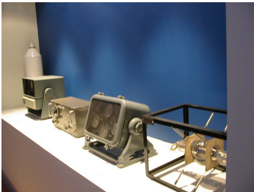
Figure 11 Radioaids.

Figure 10 Selection of some models used in Spanish lighthouses which, because of the characteristics and shape of their filaments, had to be specially made.