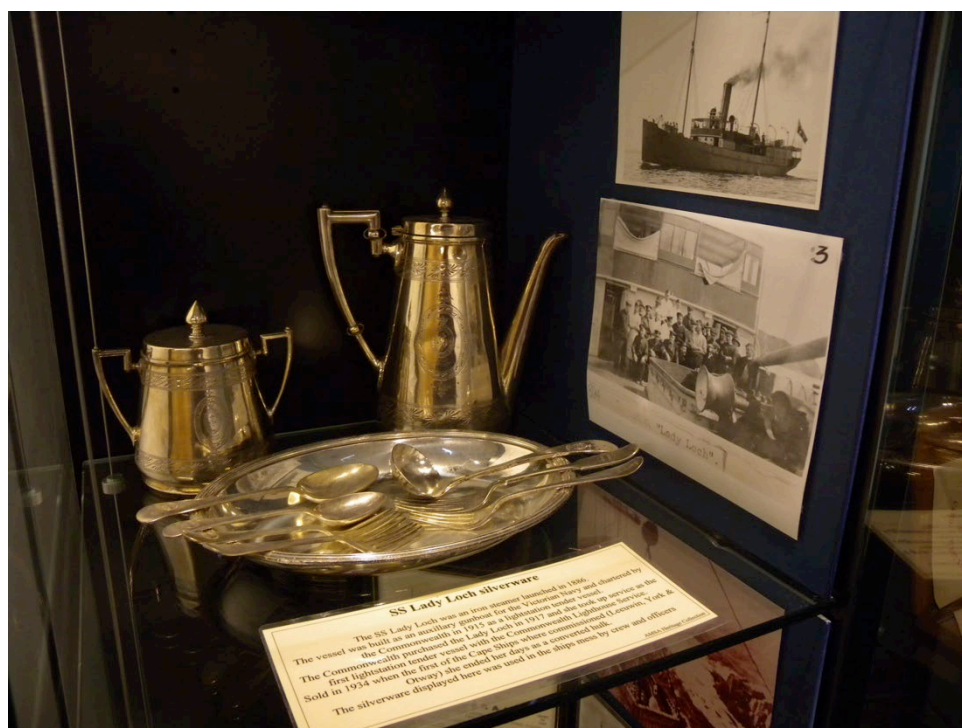
Figure 2 Cabinet display of ships silverware with photographs of the ship and crew to help tell a story.