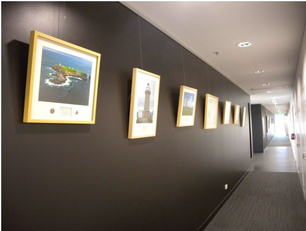
Figure 4 Photograph hanging using single hook