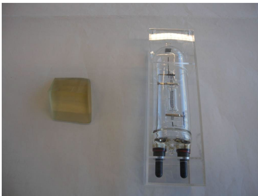
Figure 1 Fresnel glass lens section and 1000W lamp in protective container prepared as props for visitors to handle and inspect.