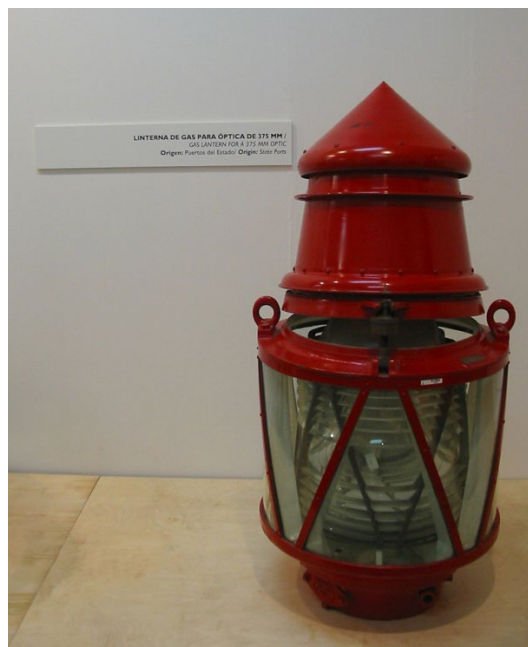
Figure 9 AGA optic 375 mm. Acetylene gas lantern with helical uprights and curved glass. Polished glass drum optic

Figure 8 manufactured by Chance Brothers, England, it was installed in Llebeigt Lighthouse from 1910 to 1973. It was transferred from Dragonera Island to Porto Pi Lighthouse Museum by a US helicopter as an underslung load.