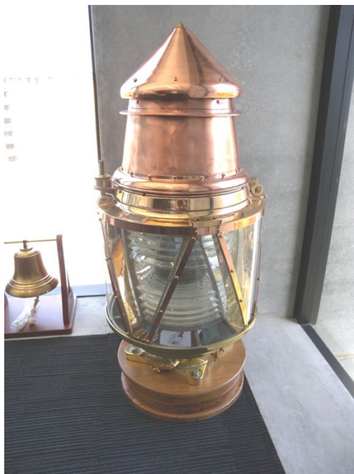
Figure 6 AGA 375 lantern prepared for office display. Original painted condition may be retained by the museum