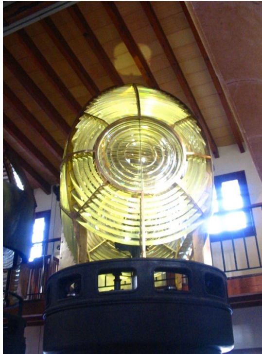
Figure 8 Lower level floor with a mercury bath, rotating machine and revolving optic

Figure 8 manufactured by Chance Brothers, England, it was installed in Llebeigt Lighthouse from 1910 to 1973. It was transferred from Dragonera Island to Porto Pi Lighthouse Museum by a US helicopter as an underslung load.