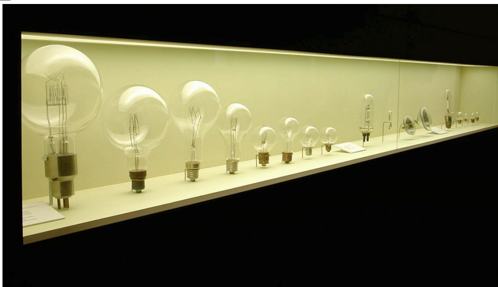
Figure 10 Various types of electric lamps for lighthouses.

Figure 10 Selection of some models used in Spanish lighthouses which, because of the characteristics and shape of their filaments, had to be specially made.