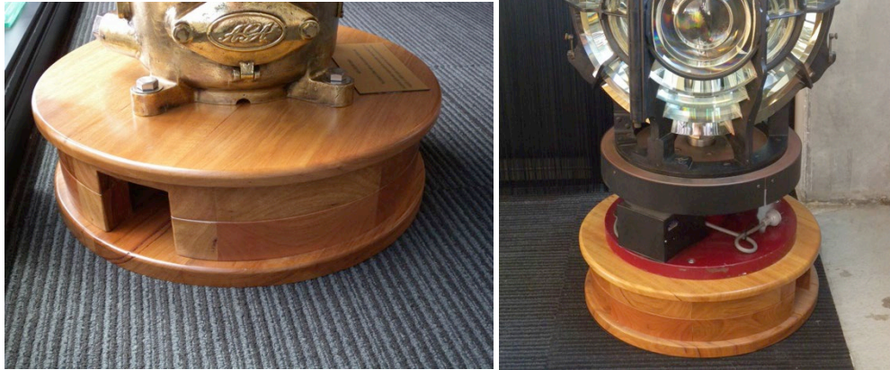
Figure 3 Wooden support bases manufactured to suit specific rotating flashing lenses