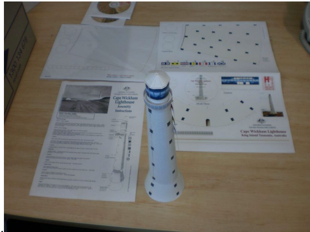
Figure 5 Colouring sheet for young children and cardboard models for older children to make