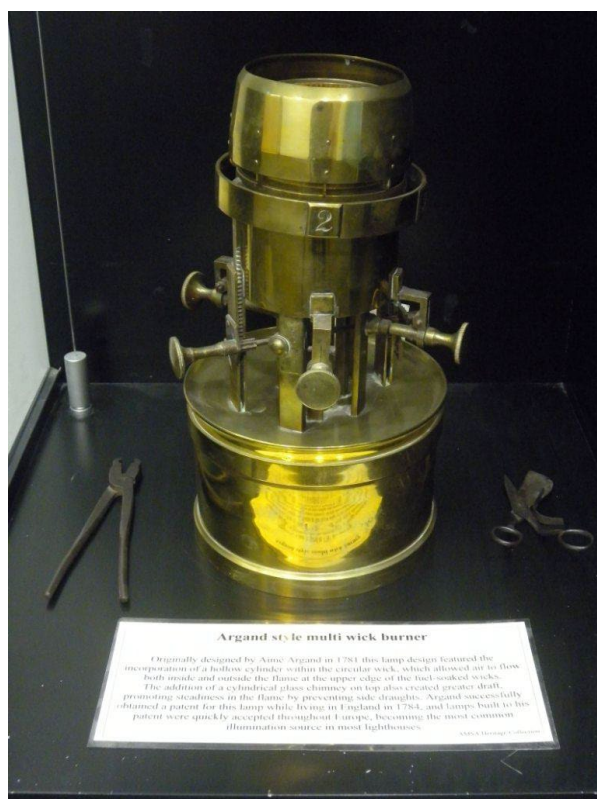
Figure 7 Argand multi wick burner in cabinet display