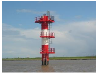
Figure 3 Example of centred figure

Figures should be centred with wrapping In Line with Text and labelled using the Figure caption (or Annex Figure caption ) style centred below the figures. Alternatively, figures can be offset with text wrapping so that the text does not overlap the figure but arranges the paragraph such that it continues onto the next line in an appropriately sized paragraph.