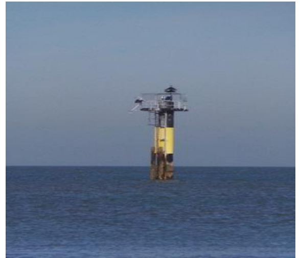
Figure 4 Example of offset placed figure

Figures should be centred with wrapping In Line with Text and labelled using the Figure caption (or Annex Figure caption ) style centred below the figures. Alternatively, figures can be offset with text wrapping so that the text does not overlap the figure but arranges the paragraph such that it continues onto the next line in an appropriately sized paragraph.